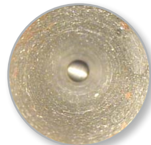
Deposits in pipe