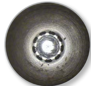
Inspection of injection nozzles