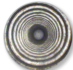
Inspection of thread turn