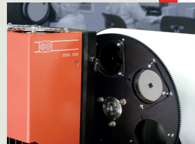
→ Motorized target wheel