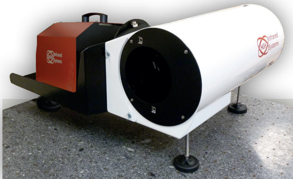
→ IRCOL 150-750 with RCN IR reference source