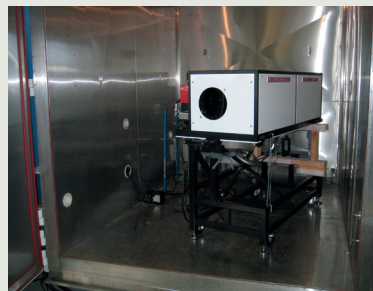
→ IRCOL 250/1500S in climatic chamber