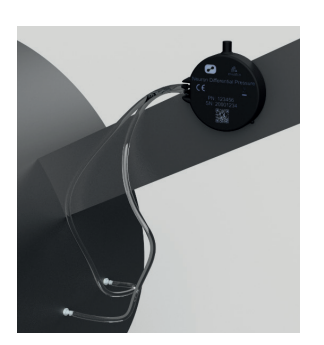
Keep antenna clear off the metallic surface