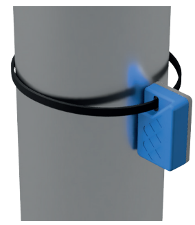
Sensors with IP67 Enclosure