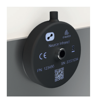
Place elevated with distance to fixed objects

All the black Neuron sensors, like the Neuron IR380 and Neuron Vibration, are fitted with a strong magnet at the back for easy fastening. If there is no magnetic surface, then double-sided tape is a good solution.