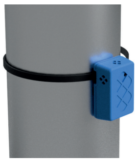
Sensors with IP21 Enclosure